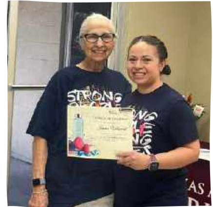
94 year old participant of SPSB receiving her certificate of completion.

They completed a 24-week program that began in January. The participants meet twice a week and complete the monthly fitness test. Regular strength training can have numerous benefits for individuals of all ages, including improved muscle strength, bone density, balance, and overall quality of life. These individuals noticed numerous improvements in their health, endurance, strength, flexibility, and balance. These participants also walked 3,525.83 miles as a team to completed an eight-week Walk Across Texas program.